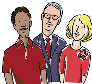
Wear Red for Pentecost

Please sign up on the clipboard in the lobby if you plan to attend!